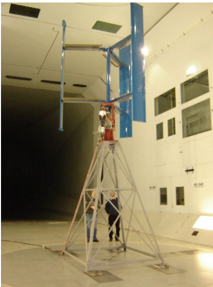
Figure 1: VAWT in NRC 9m wind tunnel

Figure 1 shows a picture of the test setup in the wind tunnel.